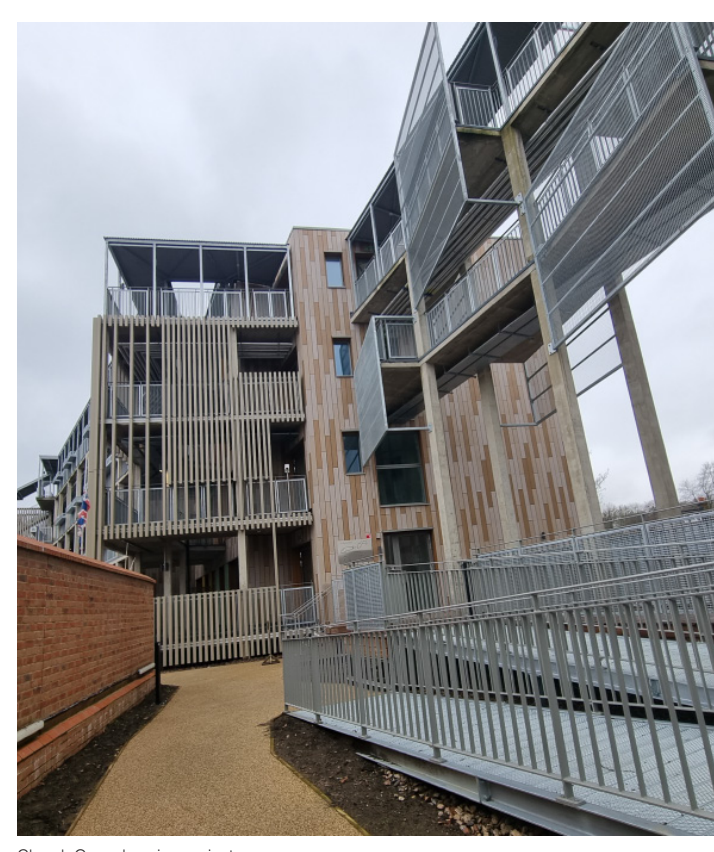
Church Grove housing project